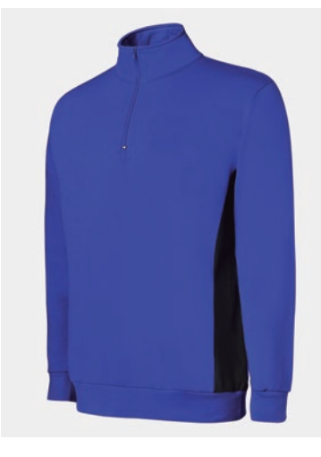
HOODIE BITONE Adjustable. Special Outdoor USE