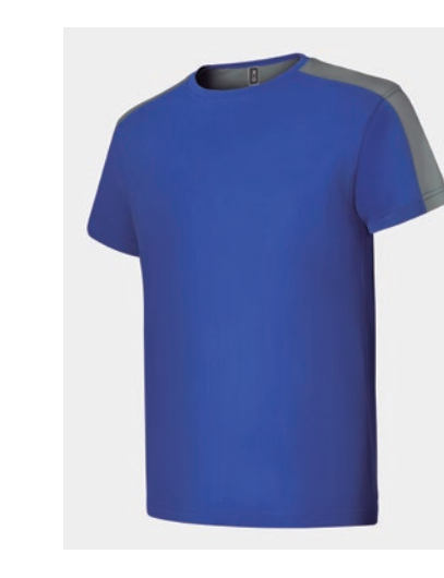
HIGH VISIBILITY T-SHIRT SLEEVE WITH HIGH VISIBILITY FABRIC