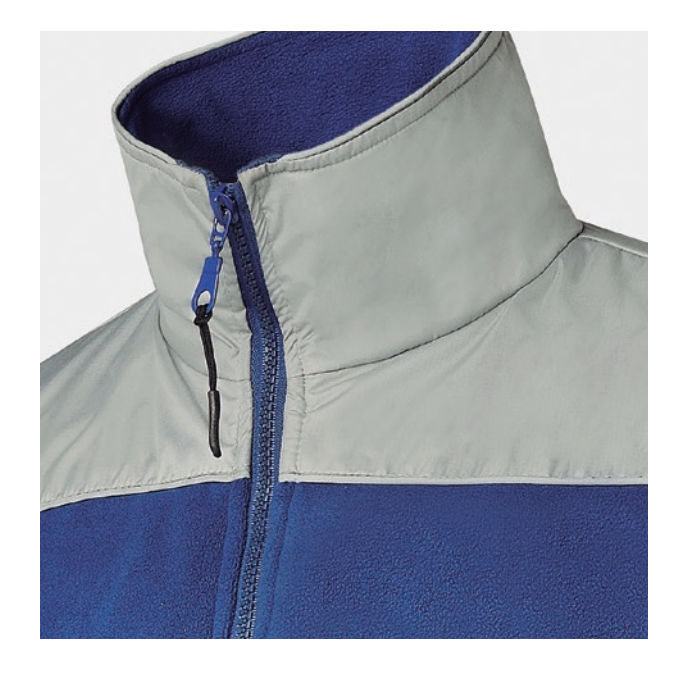
PROTECTION AGAINST COLD SPECIAL FABRICS AND FINISHES

Our experience allows us to offer an almost infinite range of possible finishes to adapt the garment to your usage needs. From different fabrics that make up the garment up to indications in the finish of cuffs or shape of the neck. Every detail is important to get total satisfaction of our customers.