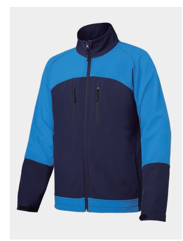
JACKET BITONE HIGHT NECK AND DOUBLE POCKET ON CHEST