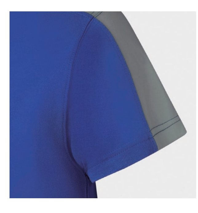
INFINITE COMBINATIONS CUSTOMIZING THE COLOURS OF GARMENT