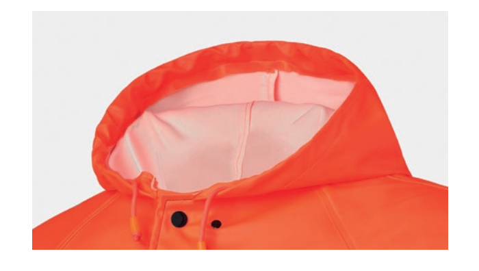
HOODIE RAIN PROTECTION