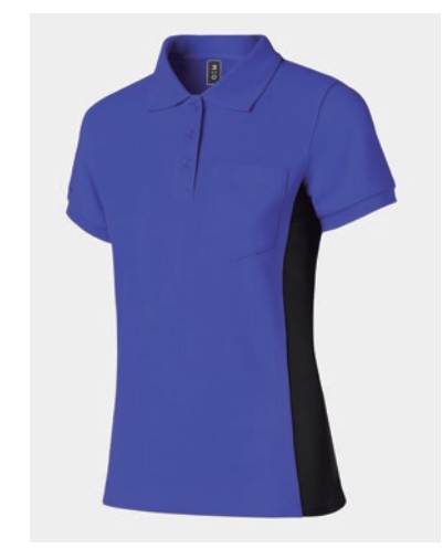
POLOSHIRT BITONE SPECIAL WOMAN WITH FITTED WAIST