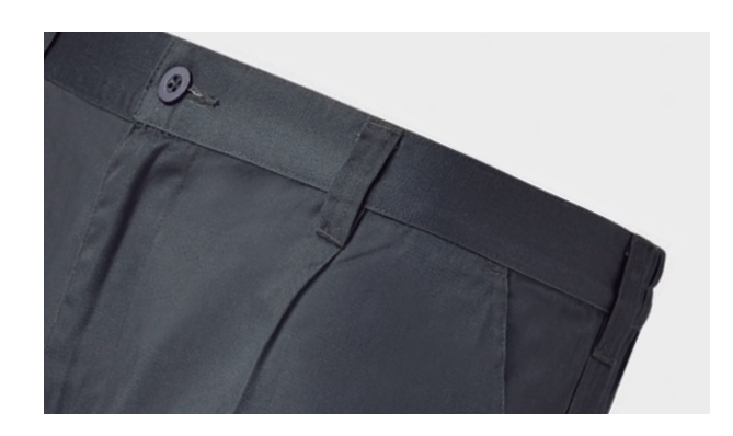
WAIST WITH OR WITHOUT ELASTIC BAND