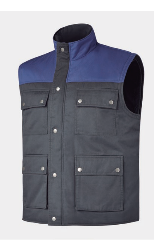
GILLET – BODYWARMER FOUR POCKETS. HIDDEN ZIPPER