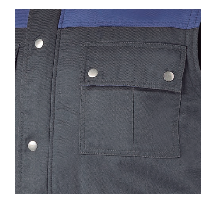
BRACKETS, ZIPPER ... DIFFERENT LOCKS FOR POCKETS